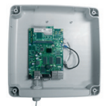
PRA standard series PRA E series Installation on the mast