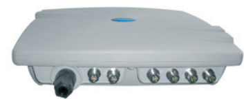
Places for external connectors PRA50021 dual H&V